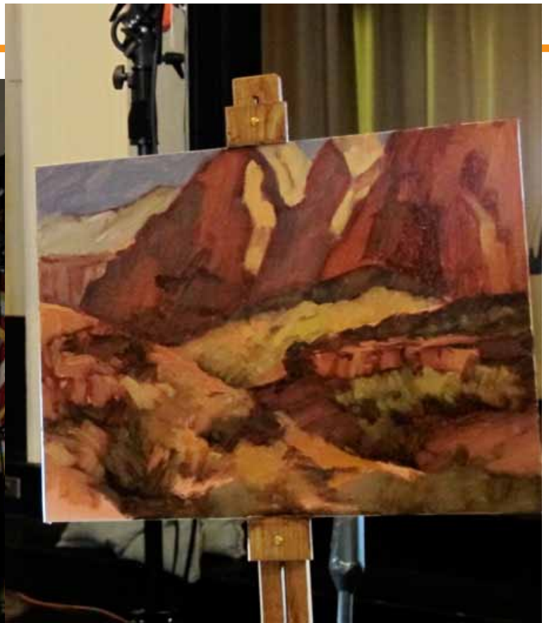
Demonstration - Jane Thorpe