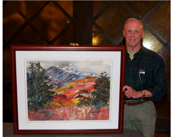
Artist of the Month