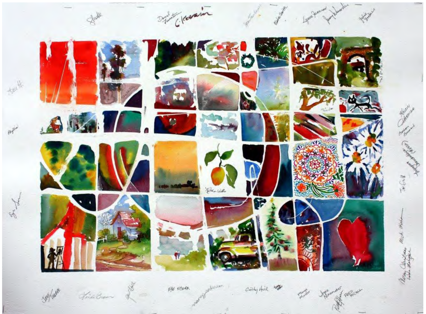
This painting was a group effort - painted by everyone in attendance.