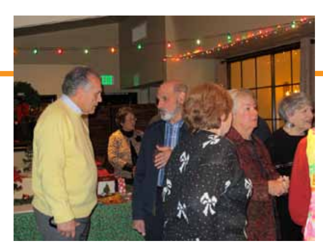
CHRISTMAS PARTY AND BANQUET