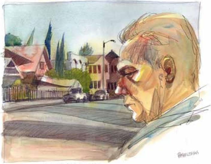
AND SOUTH BOKEHIS IN GOLD