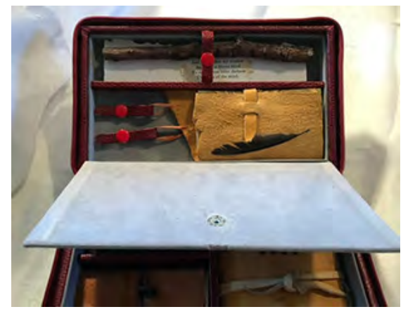
My latest piece, 4 leather-bound books within a box.