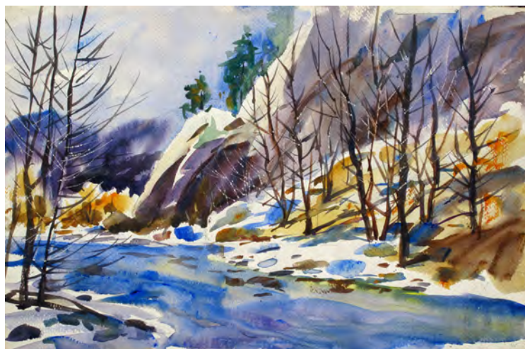
Side two of the Bohnenberger painting