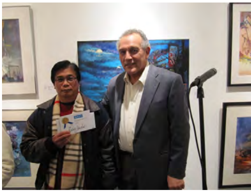
ABSTRACT / NON-OBJECTIVE 1st Place: Ruben Yadao, 'Conglomeration'