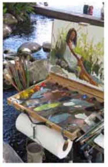
Painting models on location at the beautiful Maranatha High School Campus.