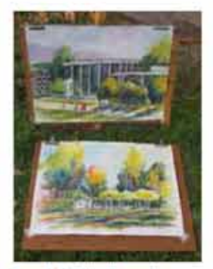
Joseph Stoddard's on-site paintings