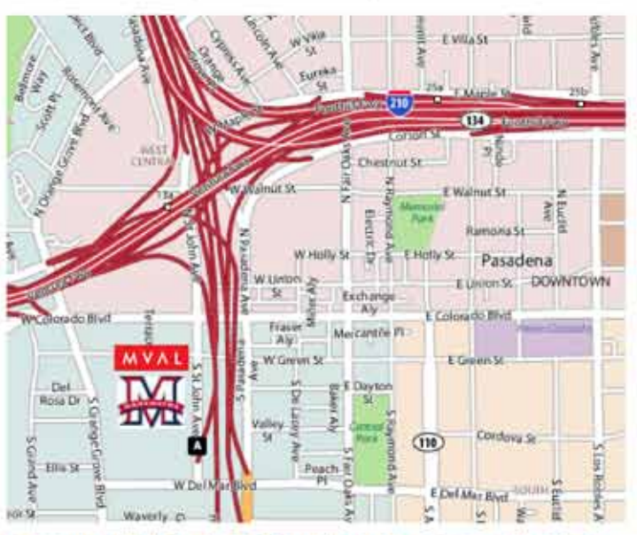
Maranatha High School, 169 South Saint John Avenue, Pasadena

From the north on the Foothill Freeway (210): Take the Colorado Blvd. exit, proceed straight onto Saint John Ave., and park in the underground parking structure on the right.