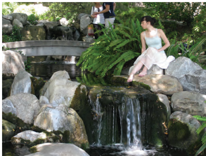
The beautiful Maranatha High School Campus is the location of this years event.