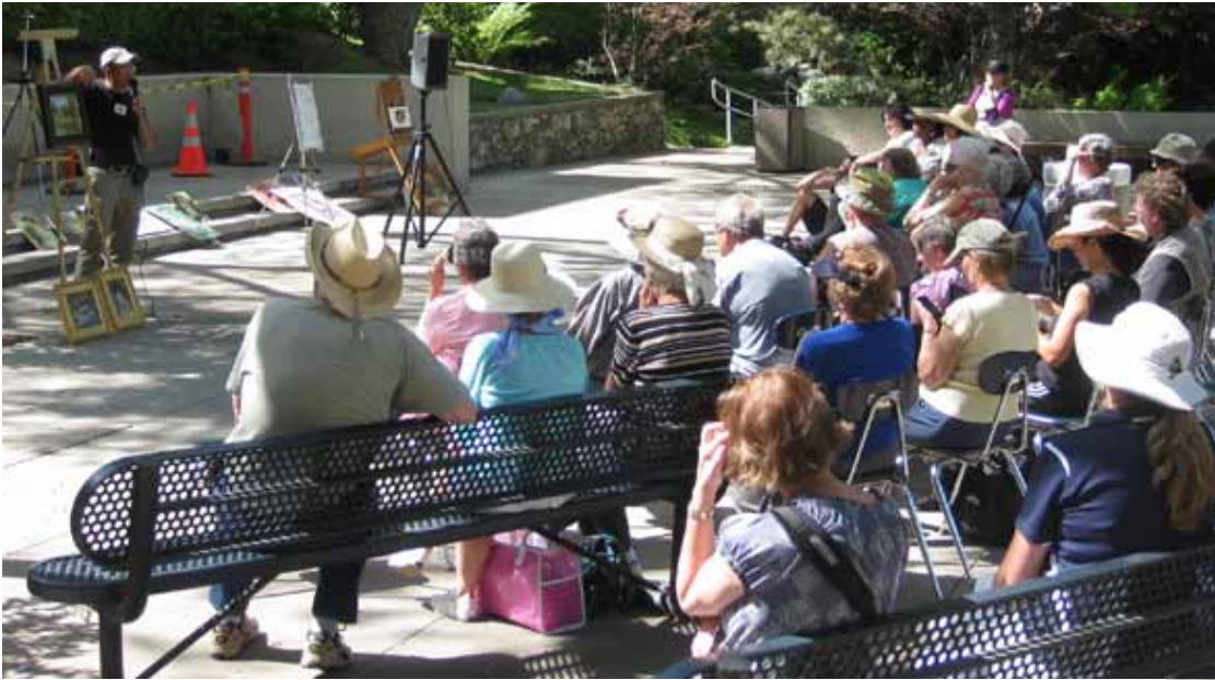
Artists presenting their paintings at the end of the afternoon.