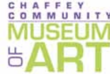
Exhibit Opens: Thursday, April 17, 2014, 12:00 pm to 4:00 pm

Location: CHAFFEY COMMUNITY MUSEUM OF ART - CCMA 217 South Lemon Ave. • Ontario • CA 91761-1623 • (909) 463-3733 www.chaffeymuseum.org