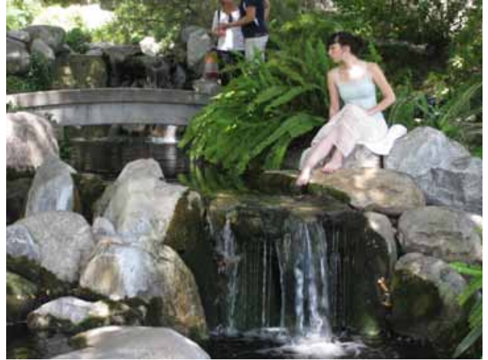
The beautiful Maranatha High School Campus is the location of this year's event.