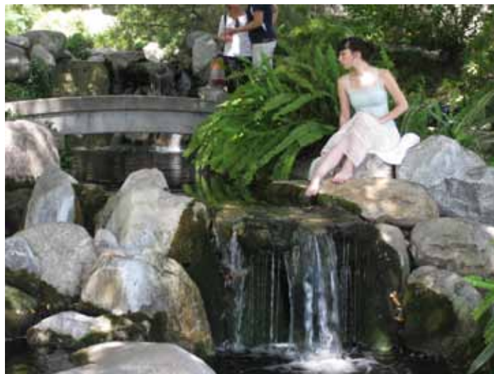
The beautiful Maranatha High School Campus is the location of this year's event.

Spend the day in the park. Bring water, lunch, your sketchbook, a comfortable chair, and your imagination. Move from venue to venue and learn from each painter.