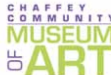
Exhibit Opens: Thursday, April 17, 2014, 12:00 pm to 4:00 pm

Location: CHAFFEY COMMUNITY MUSEUM OF ART - CCMA 217 South Lemon Ave. • Ontario • CA 91761-1623 • (909) 463-3733 www.chaffeymuseum.org