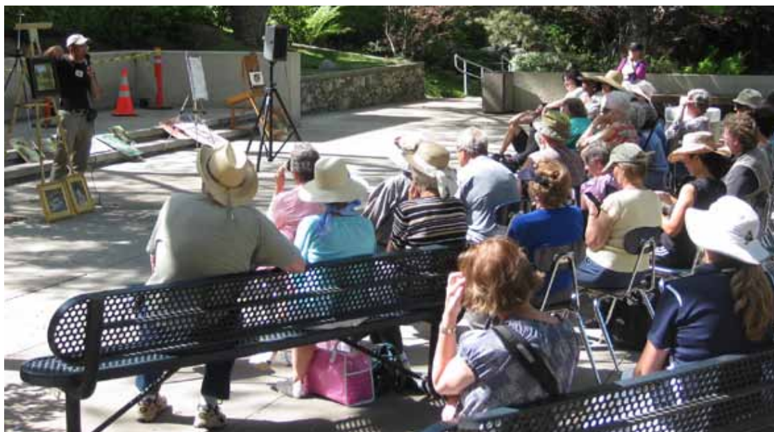
Artists presenting their paintings at the end of the afternoon.