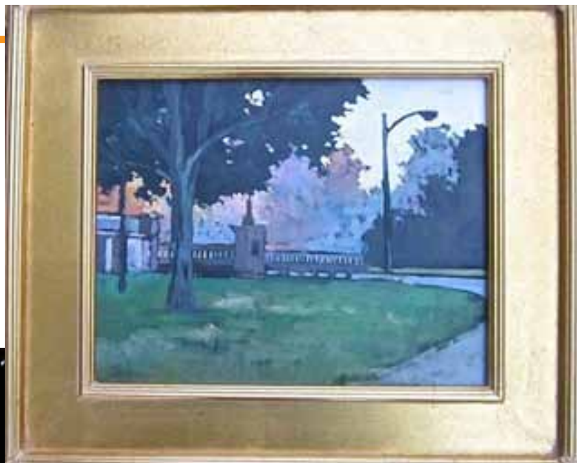
Demonstration - Lynne Fearman