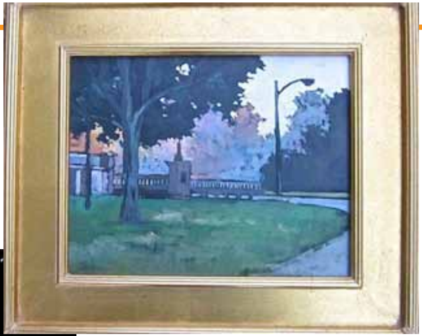
Demonstration - Lynne Fearman