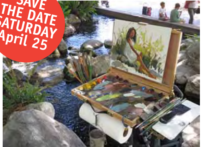
The beautiful Maranatha High School Campus is the location of this year's event.