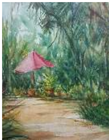
Examples of paintings donated this year