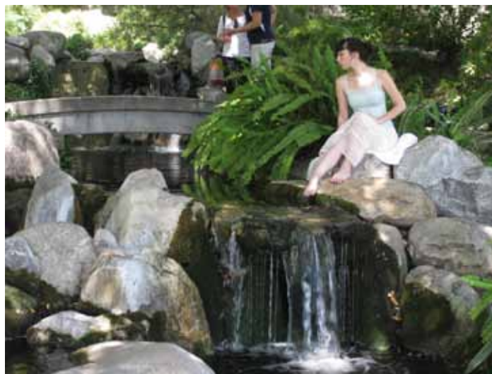
The beautiful Maranatha High School Campus is the location of this years event.