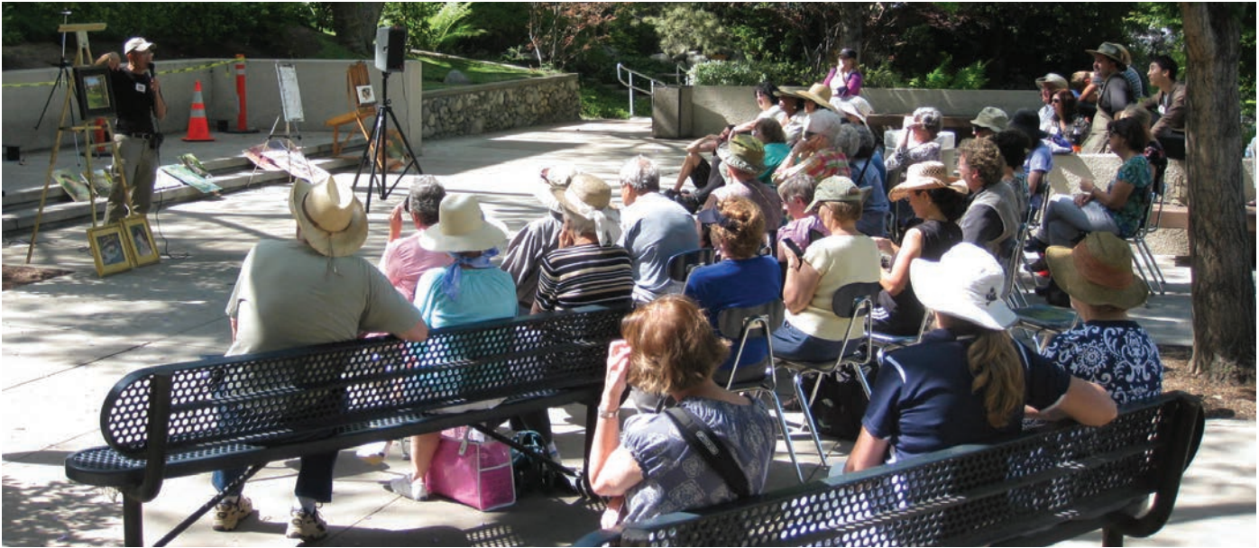
Artists presenting their paintings at the end of the afternoon.