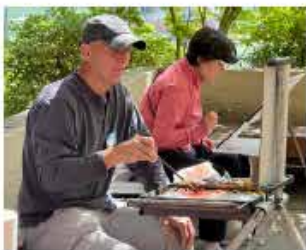
Student models will be available for artists to paint.

This is the one day a year when artists are allowed to paint in this private, secret, venue with expansive gardens, old trees, streams, fountains, waterfalls, koi pond, modern & classic architecture.