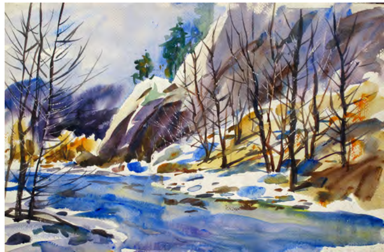
Side two of the Bohnenberger painting