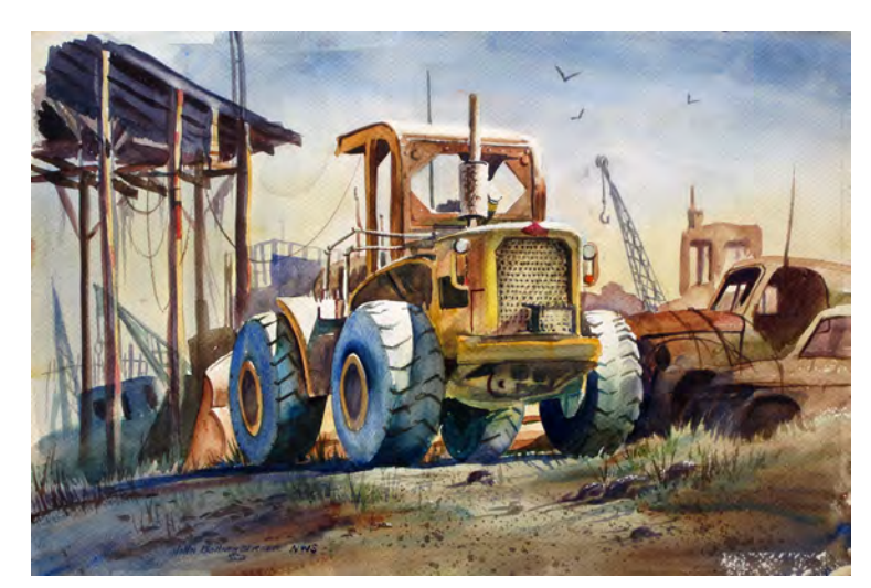
Side one of the Bohnenberger painting