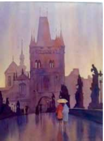
Some of the paintings that have been donated for the raffle.