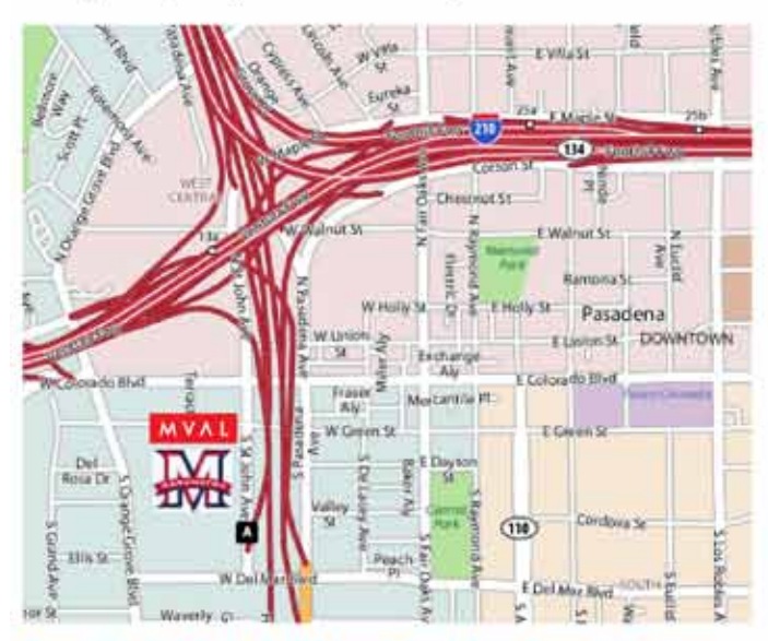
Maranatha High School, 169 South Saint John Avenue, Pasadena

From the north on the Foothill Freeway (210): Take the Colorado Blvd. exit, proceed straight onto Saint John Ave., and park in the underground parking structure on the right.