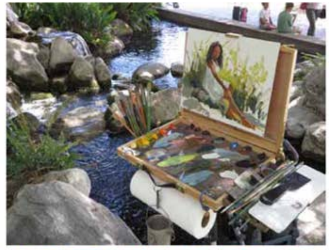
The beautiful Maranatha High School Campus is the location of this year's event