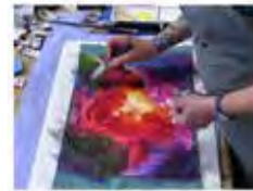
3: Lifting light values