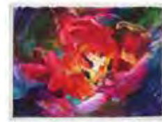
5: As far as demo got