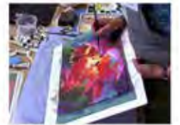
4: Glazing darks