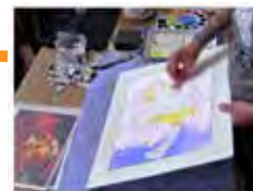
1: Transparent wash demo

I start with an intuitive paint application or blocking-in large shapes and values for painterly results. And I have developed a method to keep the painting "workable" for hours — to lift, sculpt, glaze, layer colors and values. Painting lights back in later in the sequence is more typical of oil & acrylic processes. This method can be used for a large variety of subjects AND "effects" as you can get varied results as you follow the drying down of the paper. It is truly great solution for working in dry climates, plein air and finding new visual solutions in a medium full of possibilities. You can easily get loose, flowing color, soft edges as well as crisp details. And later, rewet and rework unfinished work. And NEVER have a rumply, wavy finished work on paper my process will seem familiar to acrylic and oils painters. So if you ever thought of making a change in media, or have reasons such as travel or limited places to paint, this could speak to you!