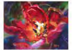
6: Work finished later on