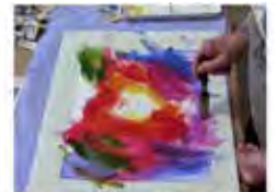
2: Smack down/block in