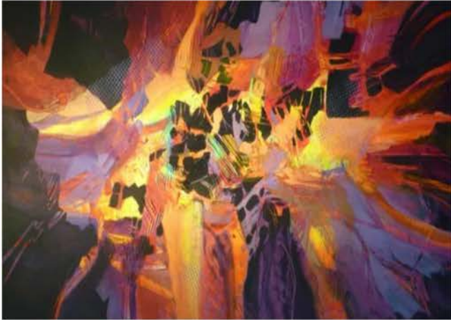
Demo will be on Wednesday, September 20, 7:30PM at the Church or through Zoom link.