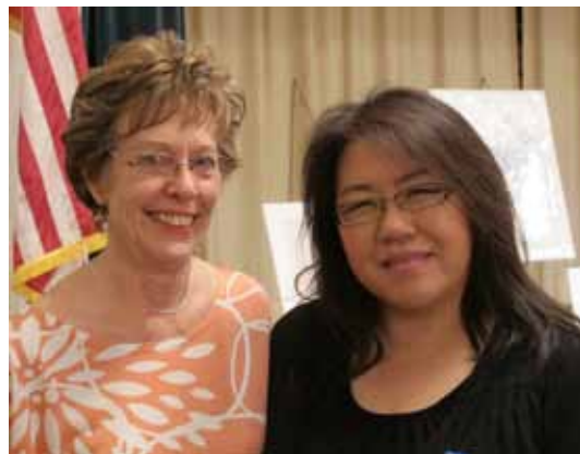
Temple City High School - software and iPads for Studio Art and Honors Courses