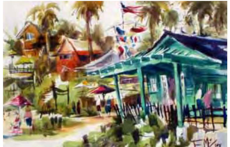
Rosina Maize Programs