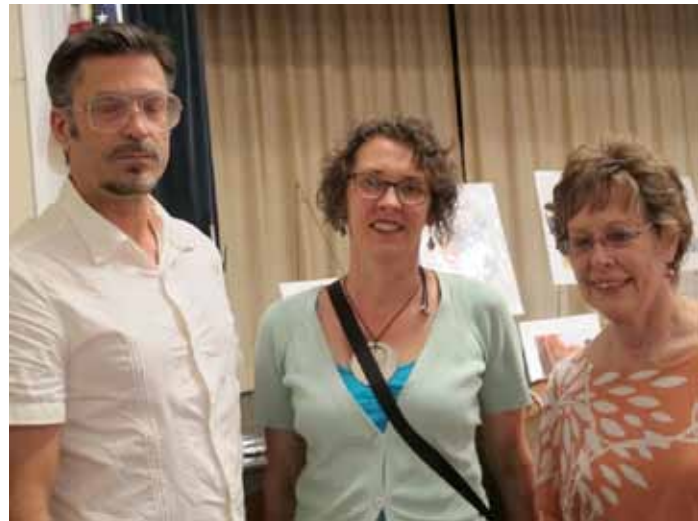
Gabriel High School San Gabriel USD - field trips to art museums and galleries