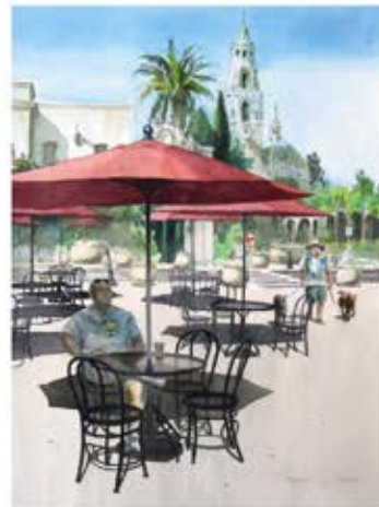
Watercolors (clockwise from left): Plaza de Panama (Balboa Park) Ocean Lily Torrey Trestle website: chuckmcphersonart.com