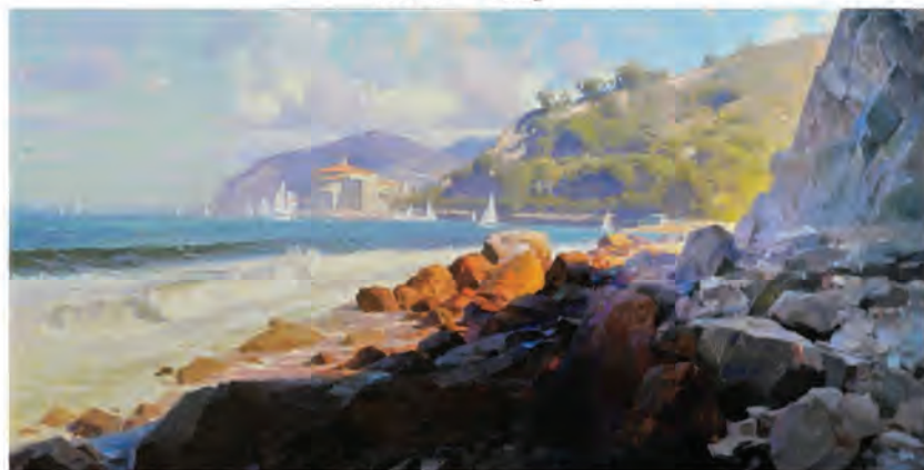
"Catalina Island" Oil on Linen 28"X60"