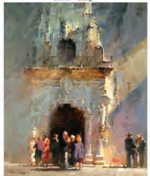
"Sunny Day in Mission San Jose" Oil on canvas 24"X30"