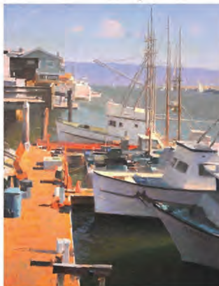
"Harbor in Morro Bay" Oil on canvas 24" X30"