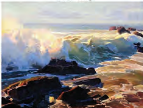
"Incoming Tide, Cambria" Oil on canvas 12"X16" 52400