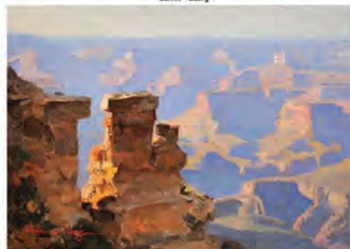
"A view from Yaki Point" Oil on canvas 12" X16"

Award-winning California Impressionist Calvin Liang will teach a three-day online workshop with focus on painting your favorite landscape from a photo. This workshop is a foundational part of training the eyes to better understand the concepts of composition, design, and color harmony.