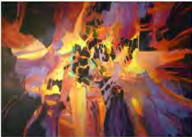
Demo will be on Wednesday, September 20, 7:30PM at the Church or through Zoom link.