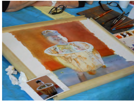
Building painting in sections - wet into wet.