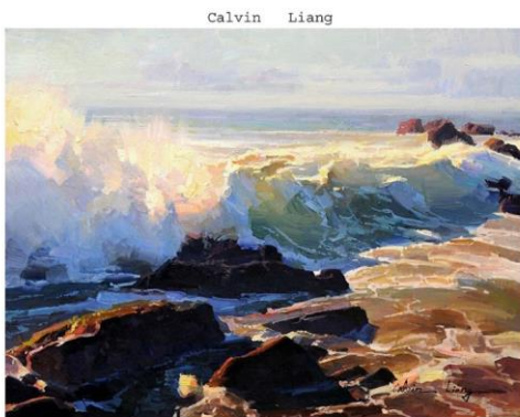
*Incoming Tide, Cambria* Oil on canvas 12"x16" $2400