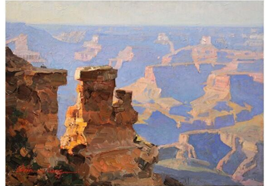
"A view from Yaki Point" Oil on canvas 12" X16"

Award-winning California Impressionist Calvin Liang will teach a three-day online workshop with focus on painting your favorite landscape from a photo. This workshop is a foundational part of training the eyes to better understand the concepts of composition, design, and color harmony.