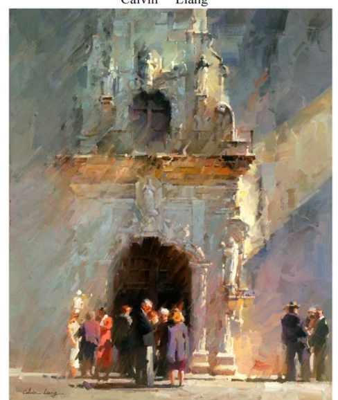
*Sunny Day in Mission San Jose* Oil on canvas 24"X30"