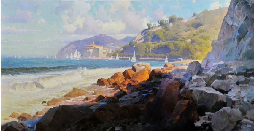
"Catalina Island" Oil on Linen 28"X60"