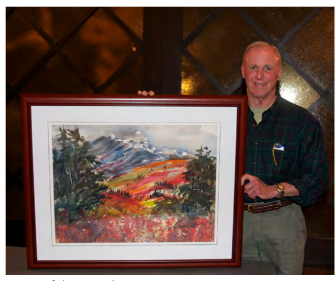
Artist of the Month