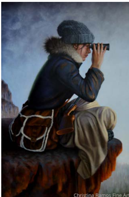
Christina Ramos Fine Art